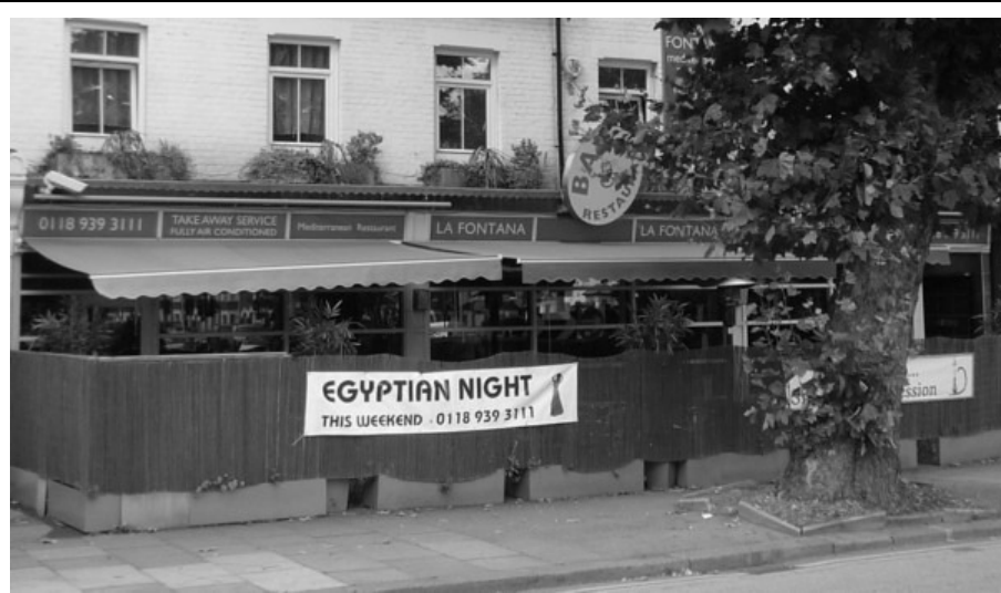
LIVELY VENUE: La Fontana restaurant in Caversham Road

La Fontana has recently come under new management and offers a wide range of food from around the Mediterranean and Near East. At weekends the restaurant really comes to life, with a variety of live entertainment from near and far. As