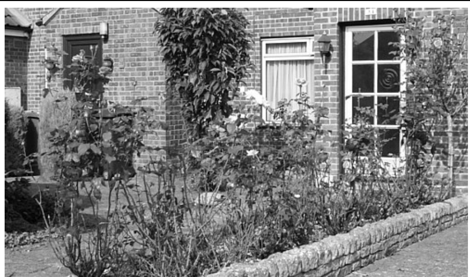
COMING UP ROSES: Winner June Ferguson's garden in Randolph Road

We had a tremendous response to our first Bell Tower in Bloom competition. The entries were of an excellent standard - it's very easy to forget how many beautiful front gardens there are in our area.